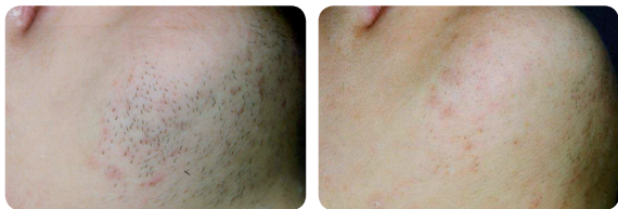
Hair removal - Before and after 3 treatments