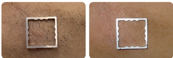
Hair removal in dark skin - Before and after 5 treatments