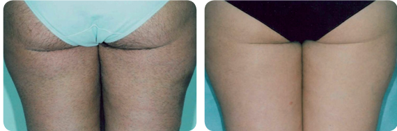
PCOS patient - Before and after numerous treatments