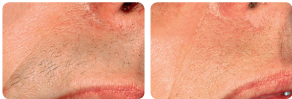
Hair removal - Before and after 4 treatments