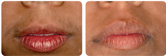
Hair removal in dark skin - Before and after 4 treatments